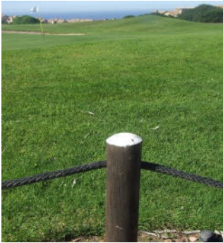
← THE OUT OF BOUNDS MARKERS AT THE 18 TH HOLE.

ANSWER:- the stakes that are marked with white paint on top is indeed out of bounds markers and considered an integral part of the course. No relief is granted and thus any drop will be penalised by one shot. Congrats to the members that mailed their answers. You were all correct.