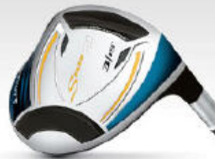
SPEEDLINE F11 FAIRWAY METALS