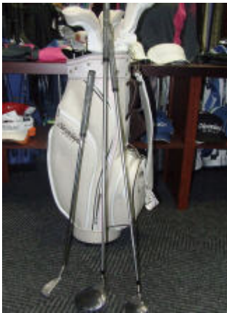
Cleveland Bloom Ladies Box Set (Complete)