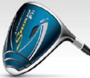
SPEEDLINE F11 DRIVERS