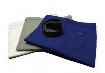
Trousers And Belt Offer

Buy any pair of trousers in store, and get a free silicone belt worth R200. This offer is valid while stocks last.