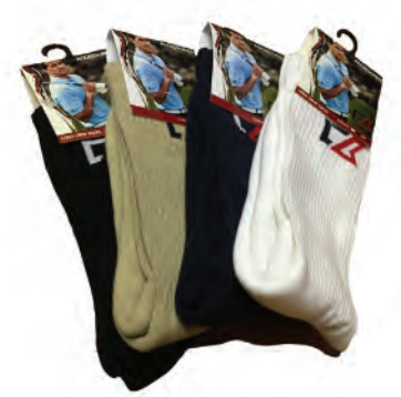
Cutter & Buck Socks Four-Pack